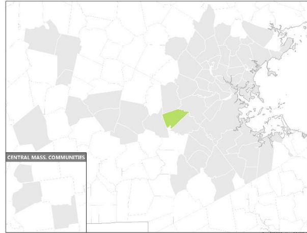
Combined Rate Increases 1990 through 2018