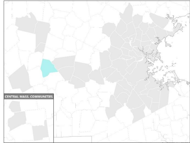
Combined Rate Increases 1990 through 2018