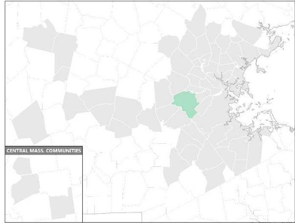
Combined Rate Increases 1990 through 2018