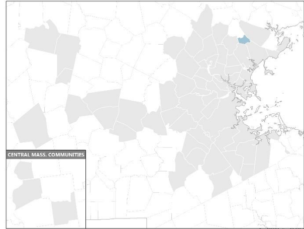
Combined Rate Increases 1990 through 2018