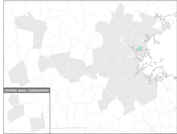
Combined Rate Increases 1990 through 2018